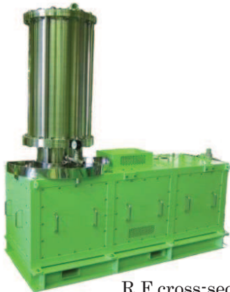
R F cross-section view